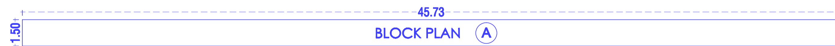
BLOCK PLAN (A)